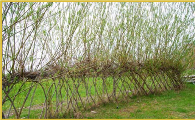
The fence before pruning with 2-year-old growth.

As for the diamond shapes that form the base of the fence, there are a few different options. First, I personally like to prune out any shoots that are produced so I can still clearly see the design. Second, you can weave these shoots back into the diamond design of the fence when they are long enough. And finally, you can let it turn into a wild, bushy shrub. No matter what base option you choose, you will still need to prune the top, or the new growth will become too top heavy for the base as it matures.