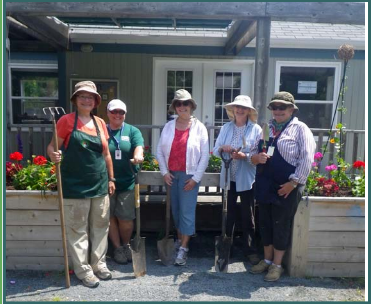
New plantings for IWK Children's Garden by Halifax Chapter members