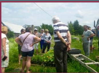
Touring an Organic Farm