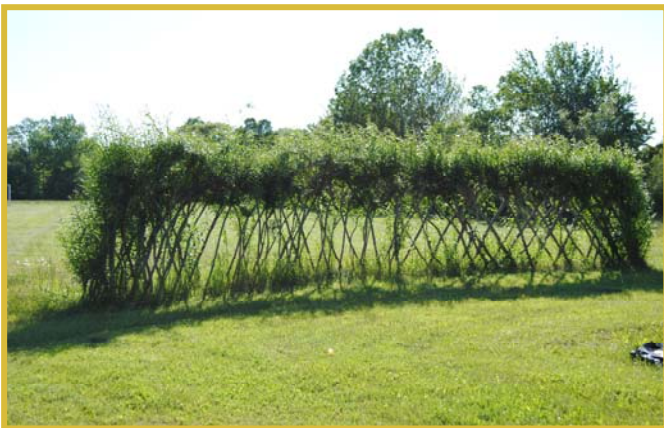
The fence after pruning with new growth.