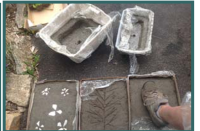
Completed Hypertufa Projects