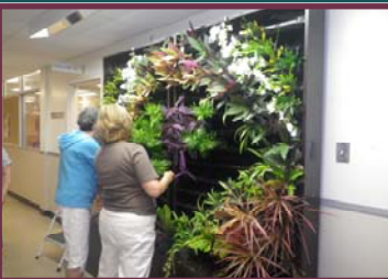
Constructing a living Wall