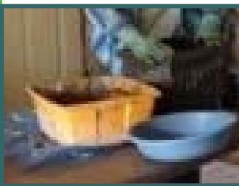
Shaping Hypertufa pot