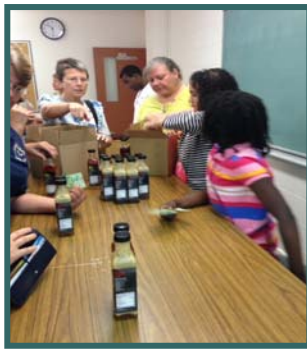
Hope Blooms children with their Community produced Salad Dressing